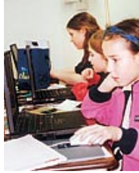
Youngsters spend a week learning the ins and outs of Web page construction.